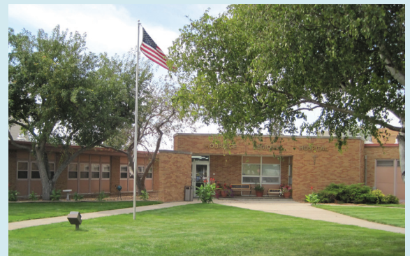
Mobridge Community Hospital circa 1994