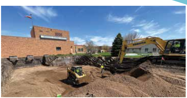
A new ambulance garage is being built next to the new addition.